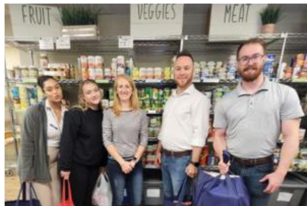
Southbury branch dropping off collected items at Southbury Food Bank.

As a community bank, we are committed to the cities and towns we serve and addressing the needs of our neighbors.