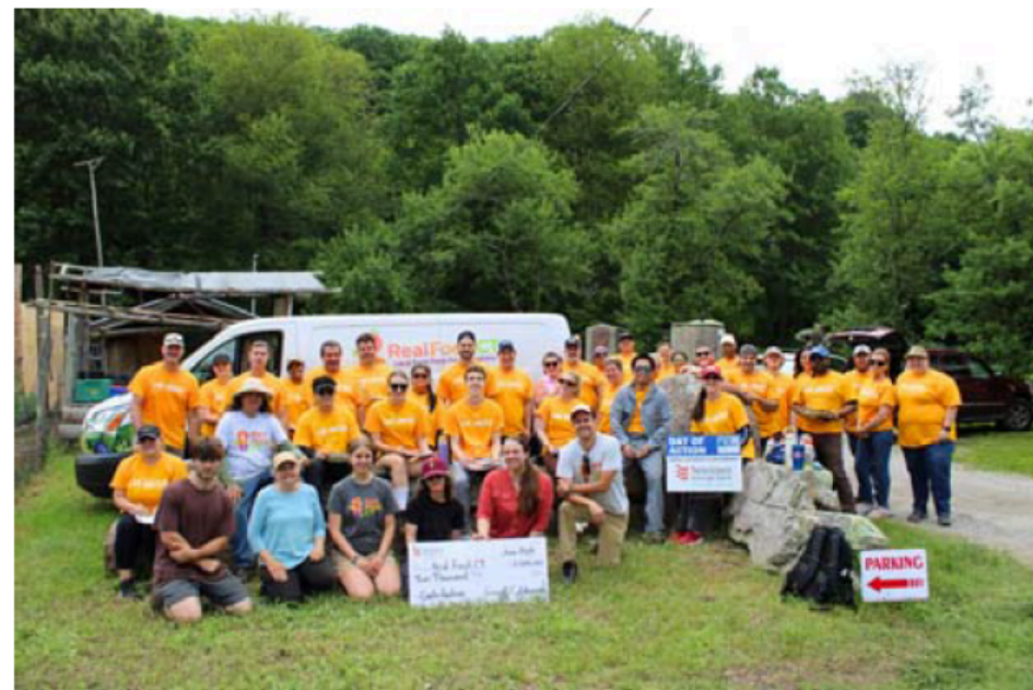
Bank employees presenting check to Real Food CT.

Alongside tending to the garden and repairing the greenhouse, the Bank also made a contribution in support of Real Food CT's mission of providing fresh produce to area food pantries.